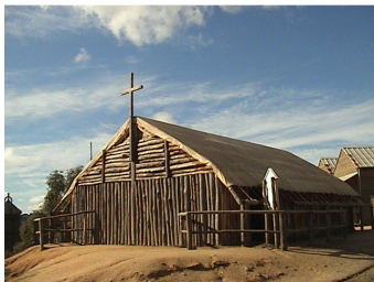
Sovereign Hill's St Alipius Church